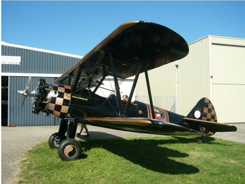
How it will be eventually.

Here is an update of the BIG BANG overhaul of our aircraft